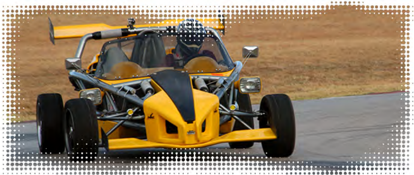
CBM TC Ecotec LNF

725 South La Cadena Drive Colton CA 92324 USA 909.291.7550